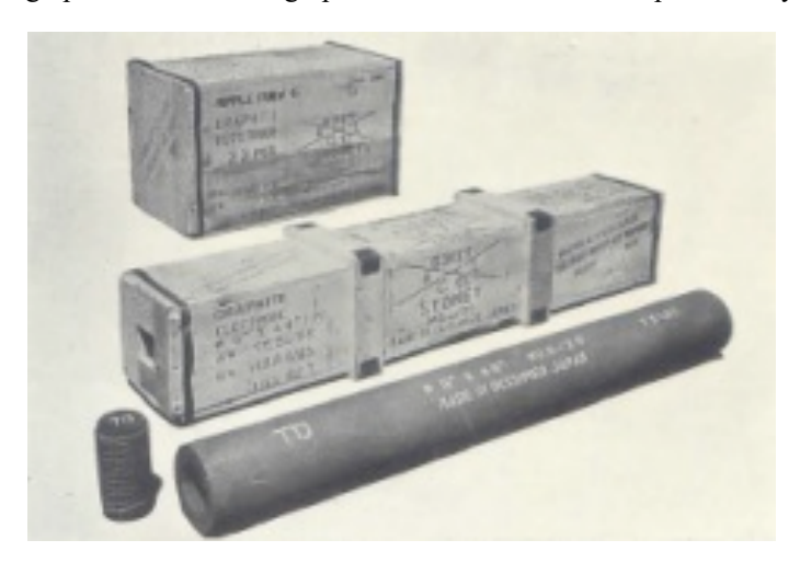
Figure 3 The Tokai Artificial Graphite Electrode with Nipple, c. 1937

A nipple is the joint at the end of an artificial graphite electrode that allows it to be attached to the electrode post in an electric arc furnace. Artificial graphite electrodes used in electric arc furnaces, and in other electrochemical industries, are fastened by threading a graphite nipple onto the end of the electrode rod at its coupling (see Figure 3 ). Especially in electric arc furnaces, graphite electrodes are subjected to shock and bending loads owing to the repulsive forces between electrodes generated by the transmission of extremely high ampere currents. As a result, the nipple joints of graphite and artificial graphite electrodes often broke prematurely during use.<sup>27</sup>