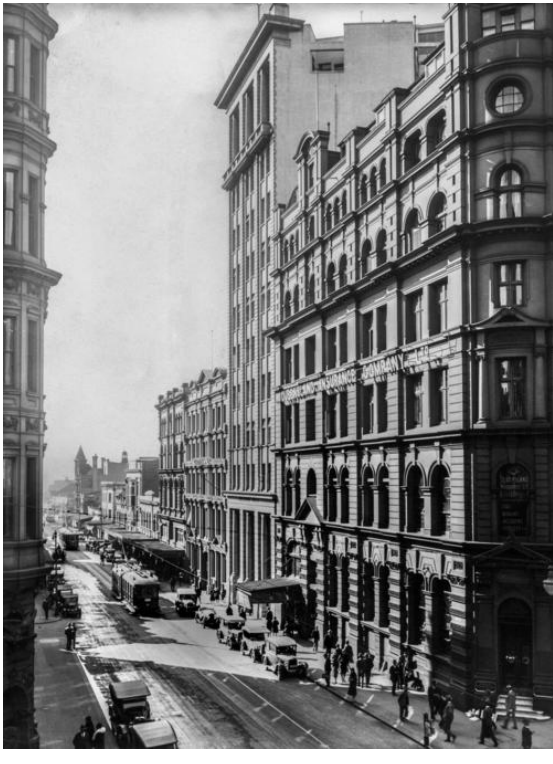
Figure 4 Endeavour House, 33 Macquarie Street, Sydney.

actively expand its business interests in Australia much beyond primary products like barley, wheat, flour, hides, and pelts. Even during the First World War, when many Japanese trading companies were opportunistically expanding the scope and scale of their international operations in the absence of European rivals, Okura & Company seemed content to focus on its role as a buyer within the wool industry in Australia.<sup>20</sup>