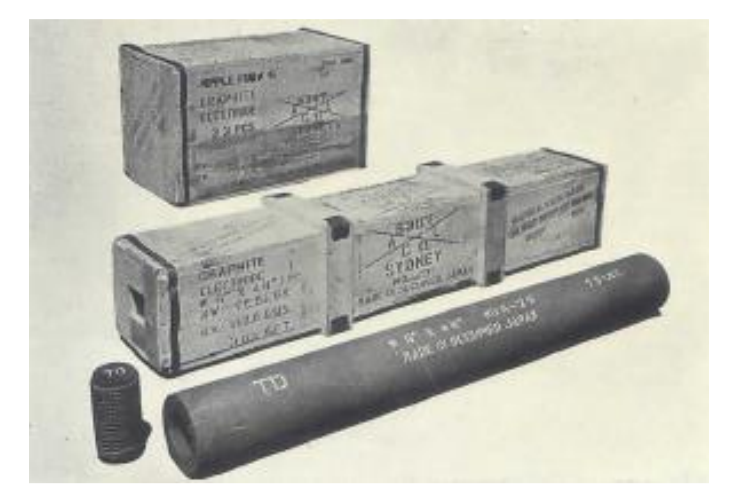
Figure 5 The Tokai Artificial Graphite Electrode with Nipple, c. 1937

A nipple is the joint at the end of an artificial graphite electrode that allows it to be attached to the electrode post in an electric arc furnace. Artificial graphite electrodes used in electric arc furnaces, and in other electrochemical industries, are fastened by threading a graphite nipple onto the end of the electrode rod at its coupling (see Figure 5). Especially in electric arc furnaces, graphite electrodes are subjected to shock and bending loads owing to the repulsive forces between electrodes generated by the transmission of extremely high ampere currents. As a result, the nipple joints of graphite and artificial graphite electrodes often broke prematurely during use.<sup>27</sup>