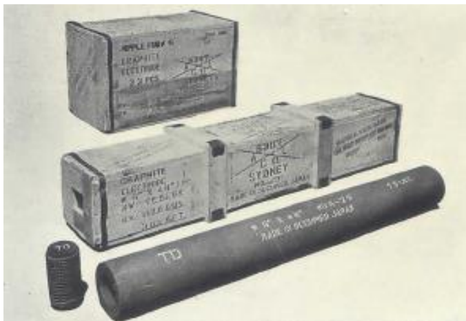
Figure 5 The Tokai Artificial Graphite Electrode with Nipple, c. 1937

A nipple is the joint at the end of an artificial graphite electrode that allows it to be attached to the electrode post in an electric arc furnace. Artificial graphite electrodes used in electric arc furnaces, and in other electrochemical industries, are fastened by threading a graphite nipple onto the end of the electrode rod at its coupling (see Figure 5). Especially in electric arc furnaces, graphite electrodes are subjected to shock and bending loads owing to the repulsive forces between electrodes generated by the transmission of extremely high ampere currents. As a result, the nipple joints of graphite and artificial graphite electrodes often broke prematurely during use. 27