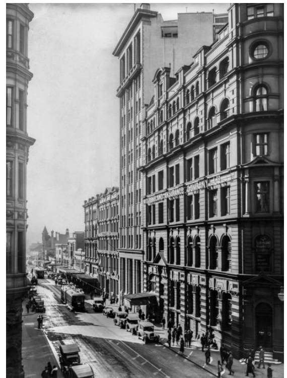
Figure 3 Endeavour House, 33 Macquarie Street, Sydney.

& Company did not actively expand its business interests in Australia much beyond primary products like barley, wheat, flour, hides, and pelts. Even during the First World War, when many Japanese trading companies were opportunistically expanding the scope and scale of their international operations in the absence of European rivals, Okura & Company seemed content to focus on its role as a buyer within the wool industry in Australia. 20