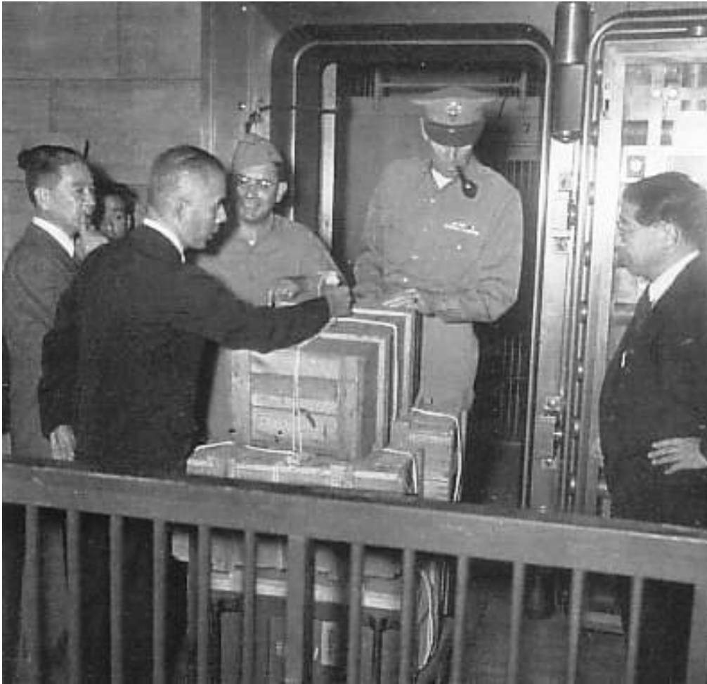
Figure 4: Seizure of Zaibatsu Family Assets, October 1946.

to two trucks 46 sealed wooden boxes containing ¥1.25 billion in stock and bond certificates, and, escorted by armed MP guards, brought the securities to the Hypothec Bank of Japan, next to the HCLC offices, for storage pending their disposal. 14 Following this dramatic photo opportunity, the commission proceeded over the next three weeks to secure the stocks of the holding companies of the other big four zaibatsu—Sumitomo and Yasuda—as well as Nakajima Aircraft 15 in this first round of designations.